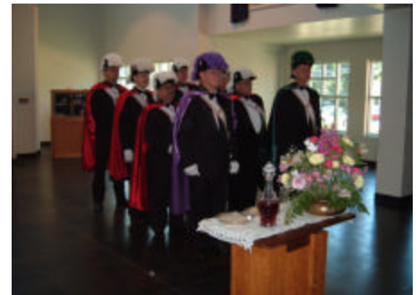
The Confirmation ceremony at St. Joseph's in Starkville

The Sir Knight Eugene Hicks Assembly lines up prior to Mass. They provided an Honor Guard for the Sunday May 1st Confirmation Class that included St Joseph's in Starkville as well as Immaculate Heart of Mary Mission in Houston