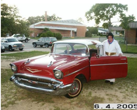
Elvis will make another appearance in D'Iberville at this year's Council 9094 stage production, "Prom Knight".

Could this be another award winning production from Council 9094 D'Iberville?