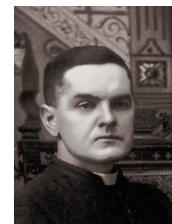
Fr. Michael J. McGivney

tenderness of Father McGivney, his avid intellect, his sense of humor, courage, energy and fervor, especially by exploring deeply the powerful relationships that distinguished Father McGivney's life.