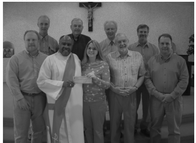
Brother Knights of the 11904 St. Lucy council presenting a check for $1202.00, proceeds of the Tootsie Roll drive, to the Community based education teacher of the George County School System.