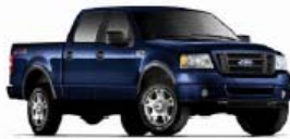
2008 F-150 Extended Cab

DOOR PRIZES ! REFRESHMENTS!! LUNCH PROVIDED