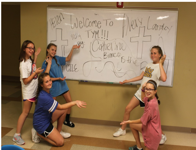
Former TYM members enthusiastically welcome new members and their instructors to the first meeting of the Total Youth Ministry for the 2016/2017 scholastic year.