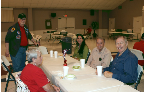
Assembly 2227 hosted a Veterans Day Luncheon on November 9 and served about 60 Vets and family members. Red Beans and rice were served with salad and drinks to area Vets.