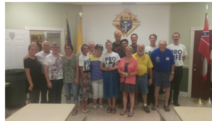
Crossroads walkers with their host families