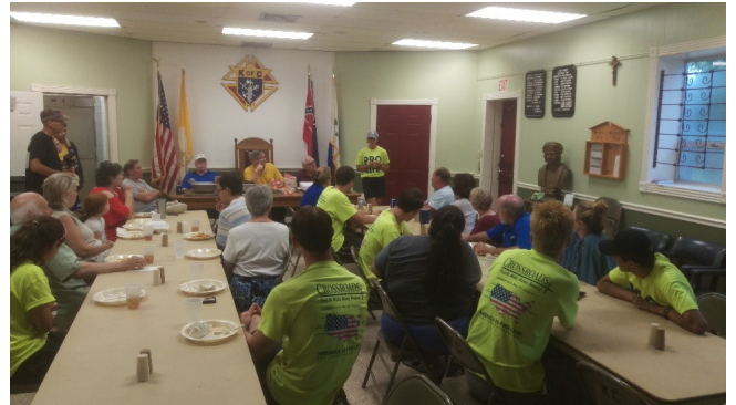
One of the walkers presents their story and mission

On Friday, July 13 th , the Vicksburg Council 898 welcomed the group of nine walkers from Crossroads who were walking the southern route. Crossroads is an organization that sponsors walks across the United States and Canada during the summer break from college to bring attention to pro-life issues. There are three routes in the United States and one in Canada. The southern route began in Los Angeles on May 18 th and ends in Washington DC on August 11 th , where it meets the walkers from the central and northern routes. On Friday evening, the walkers were treated to hamburgers and hotdogs and given the opportunity to cool off in the council pool. At the end of the evening, the walkers divided up went to stay in the homes of four council members who had volunteered to host the walkers.