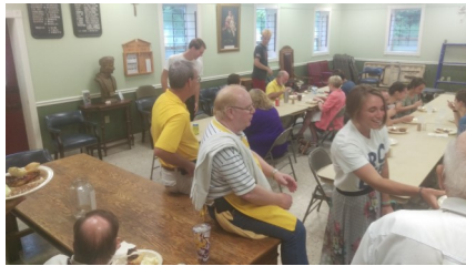
Walkers enjoying Sunday evening meal with host families

This tour began at the council Monument to the Unborn at the city cemetery. They then went through the Vicksburg Military park and toured the Vicksburg historic district. The group of walkers that went to Jackson stayed in Jackson to speak at the Sunday evening masses. At the end of the day all of the walkers returned to the council home for a meal of Bar-B-Q chicken and fixings with their host families.