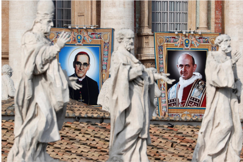
Portraits of Pope Paul VI, right, and Archbishop Óscar Romero at the Mass on Sunday.

A United Nations truth commission found that Archbishop Romero's killing had been organized by Roberto d'Aubuisson , a Salvadoran politician and death squad leader who died of cancer in 1992. Others were also believed to have been involved.