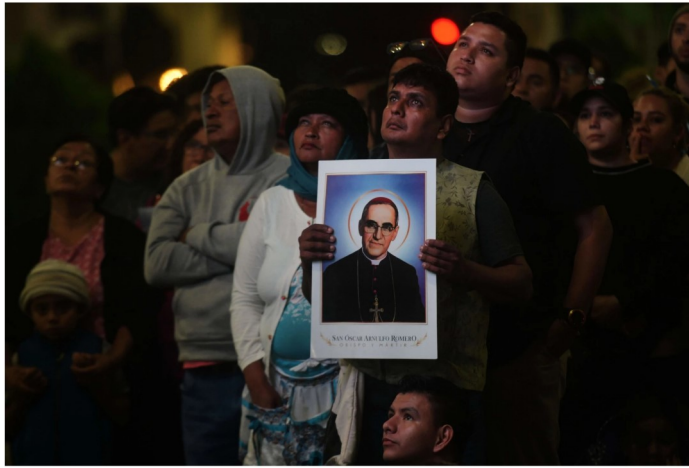
Catholics in San Salvador watched a televised screening on Sunday of the canonization ceremony of Archbishop Óscar Romero.