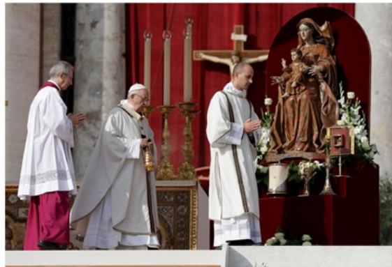
Pope Francis, center, at St. Peter's Square at the Vatican, where he also made saints of Pope Paul VI and five others on Sunday.

On Sunday, Francis wore the bloodstained cincture of the martyred archbishop, who was killed by a right-wing death squad on March 24, 1980, while celebrating Mass. The pope also used a cloak, staff and chalice belonging to Pope Paul VI.