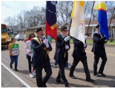
March for Life held this February