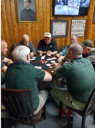
Card party for Knights and ladies