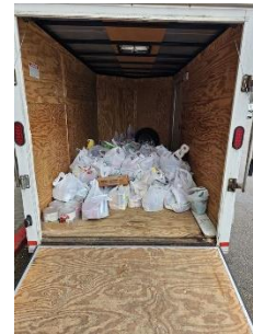
Council 898's food drive collection