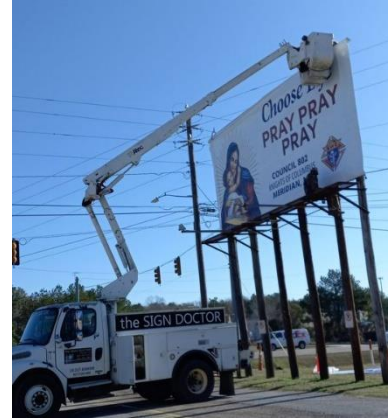
Council 802 had a new Pro Life signed installed.