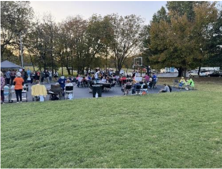
Trunk or Treat at Queen of Peace Catholic Church. Knights cooked dinner for all who attended.