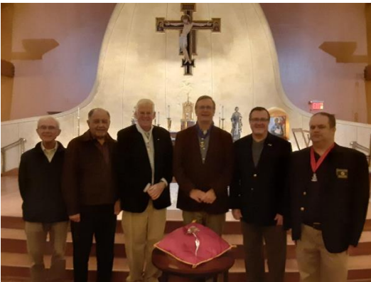
Som pics from the Silver Rose transfer.