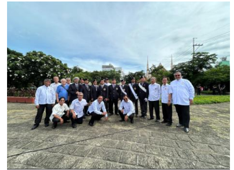
The first photo is on National Heroes Day and the others are from the Council Officers Installation.