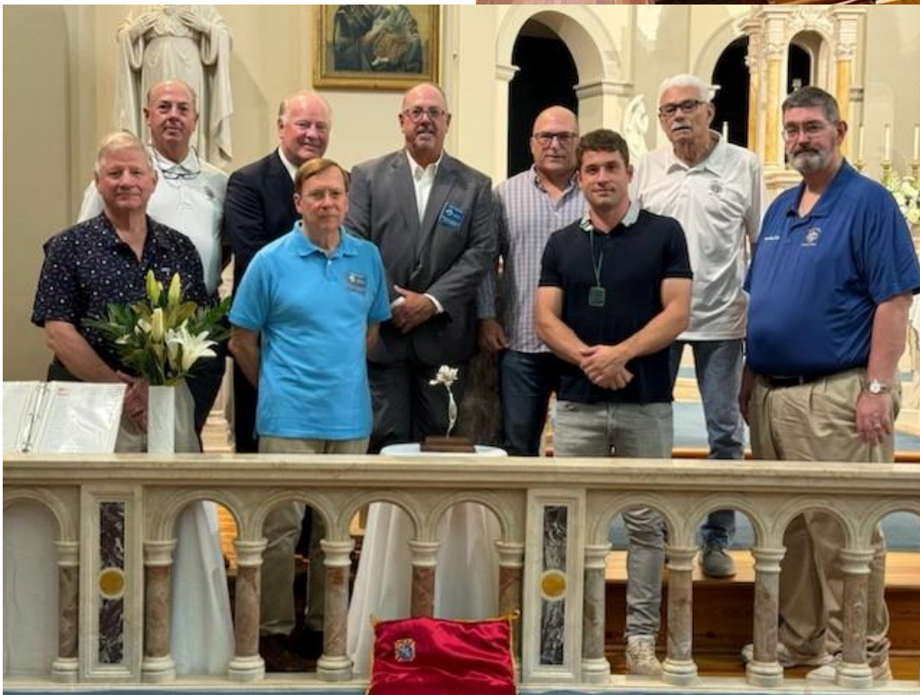
Our Lady of the Gulf\Council 1522 Cor Gathering