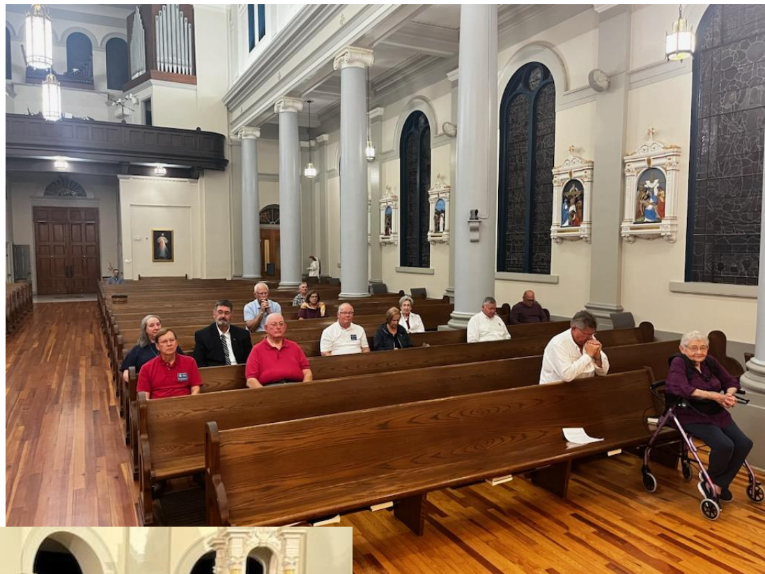
Our Lady of the Gulf\Council 1522 Silver Rose\Holy Mass