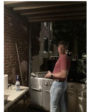
Trunk or Treat. Food cooked by Knights.