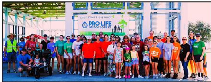
Group photo of Biloxi "Walk for Life" participants