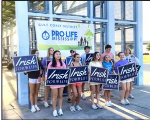
Youth from St. Patrick High School- Biloxi "Students for Life" Club