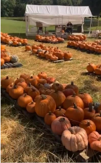
Council 7120's annual Pumpkin Patch to raise money for Coats for Kids!