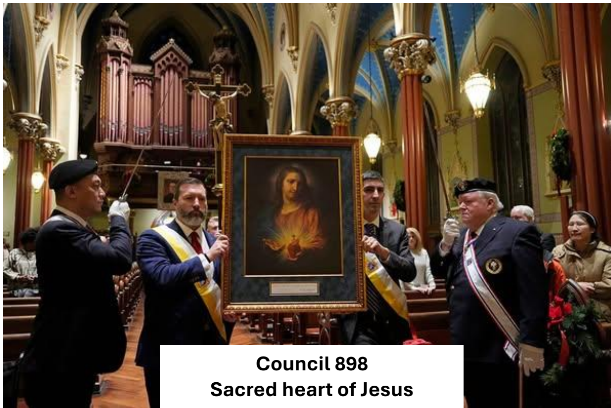
Council 898 Sacred heart of Jesus