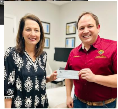
Council 6765 Starkville Pregnancy Care Center Donation