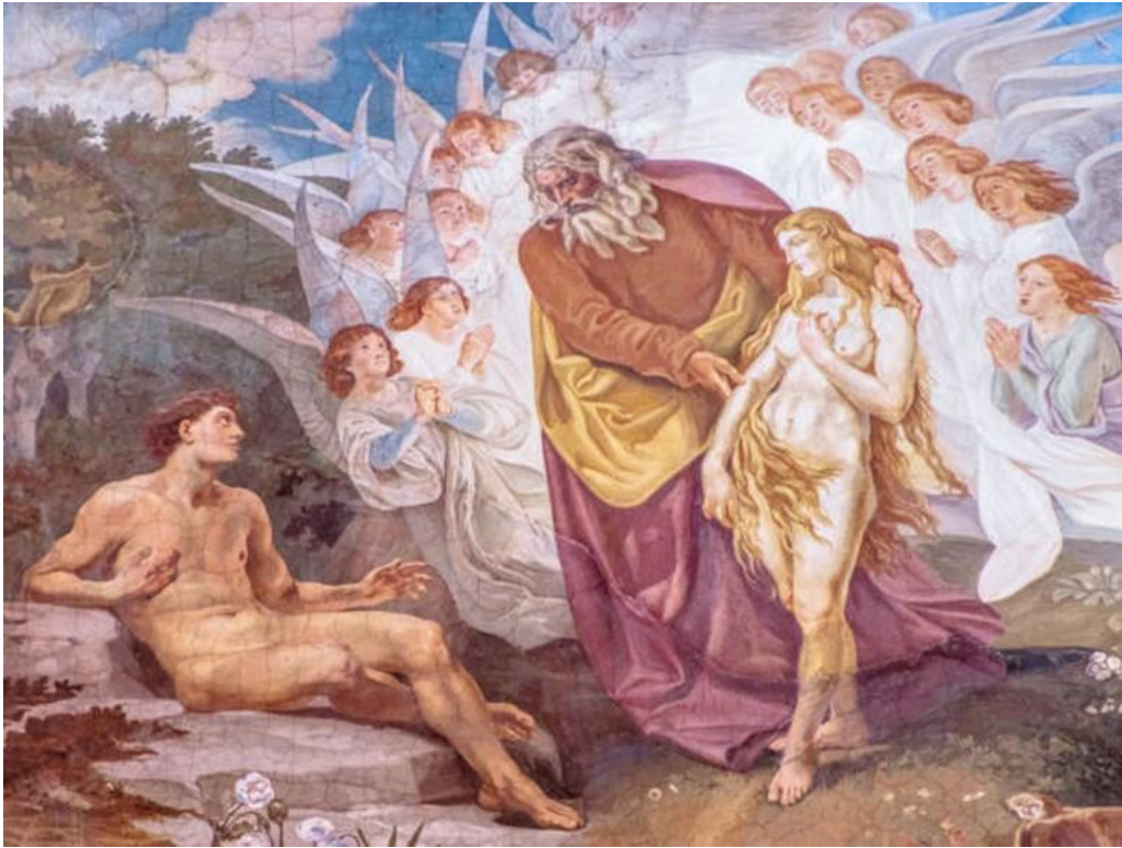
Fresco of God presenting Eve to Adam in the Garden of Eden (Cathedral of St. Peter - Dakovo, Croatia)

“It is not good that the man should be alone; I want to make him a help similar to himself” (Genesis 2:18)